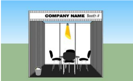
9 sqm (3 x 3)