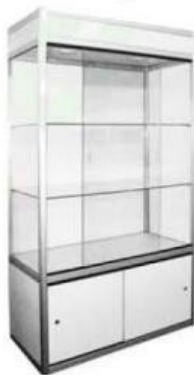
C12 – Showcase $375