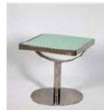
C8F – Side Table $80