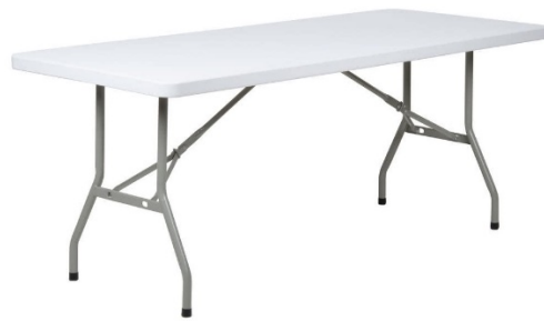
TBL 001 Rectangular Table 30" x 72" $125