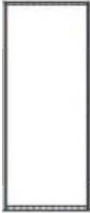
C14 – Basic Panel $70