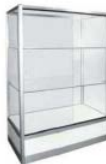
C12B – Showcase $375