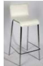
C6D – Cocktail Chair (high) $80