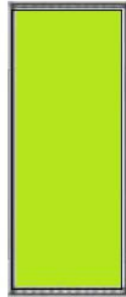
C15 – Colored Panel $170